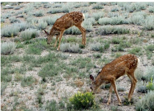
July 03, 2013

Here are pictures of visitors the afternoon of 07/03 and flowers in July. There has been a fair amount of precipitation, but it is drying out quickly.