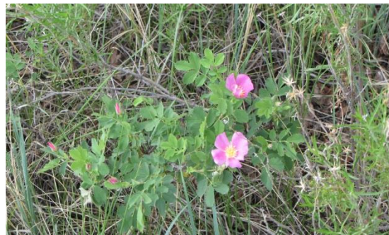
July 01, 2013