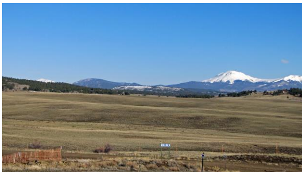
Early morning the 10 th of May 2013

Here are pictures from 05/10 in the morning and sunset on the 14th to give you a feel for the weather the last couple weeks here on the Ranch.